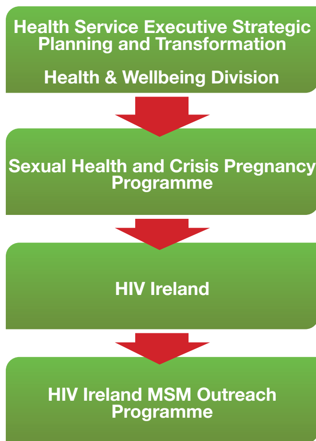
Figure 2: Organigram

In order to facilitate improved understanding of the structures and context of service delivery, an organigram (see Figure 2) was developed in consultation with the HSE Sexual Health and Crisis Pregnancy and Sexual Health Programme.